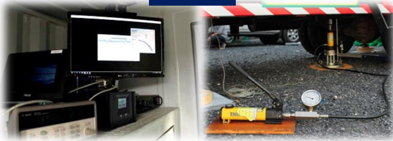
Plate Load Test is an in-situ test which is widely used to determine ultimate bearing capacity of soil for the design of foundation and the modulus of subgrade reaction for evaluation and design of pavement and foundation structures.

Depending on the requirements, the plate load test can be carried out in accordance with ASTM D1194, ASTM D1196 or DIN 18134. A loaded truck or other reaction frame, hydraulic jack, bearing plates, load cell, dial gauges or displacement transducers and deflection beams are needed in the test.